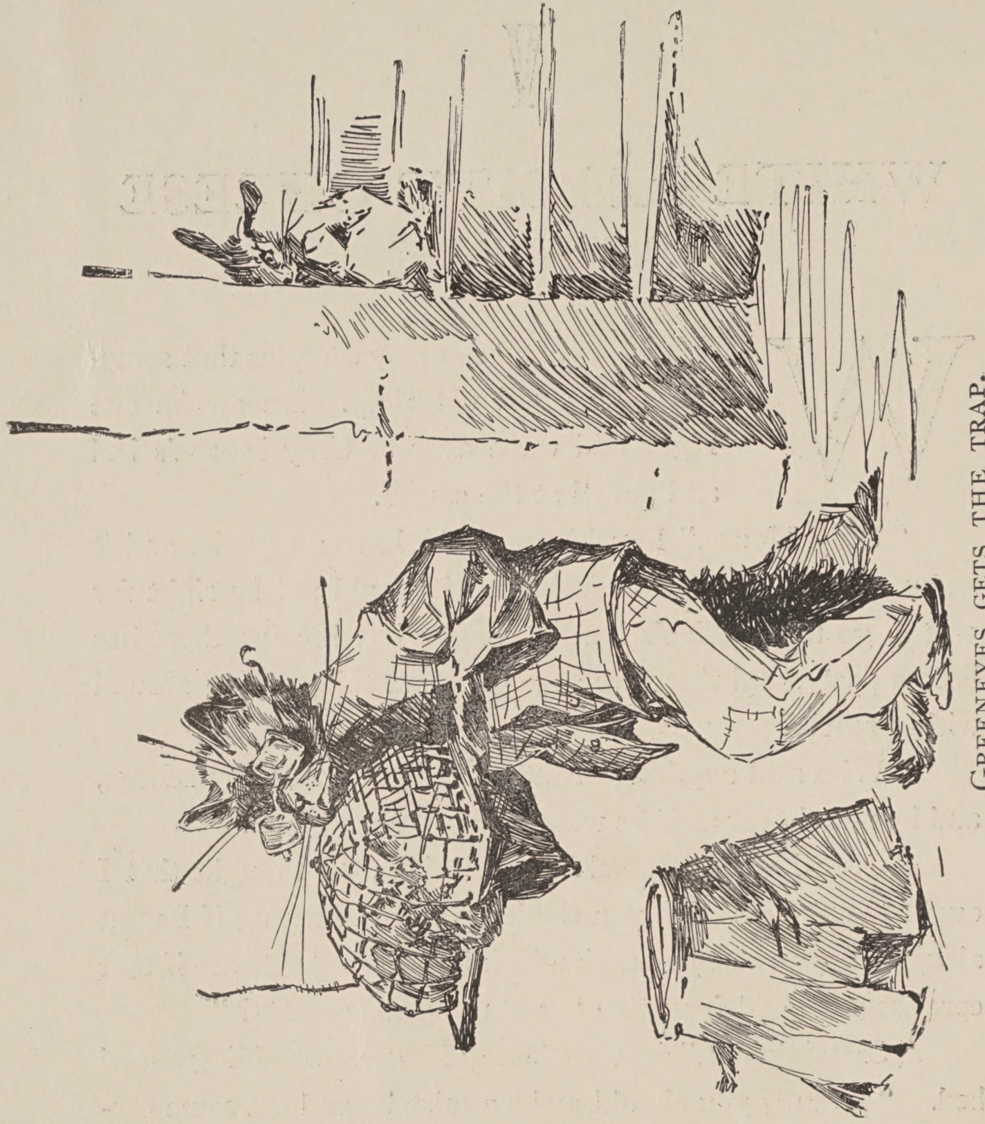
GREENEYES GETS THE TRAP.